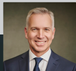
MAYOR ROSS SIEMENS