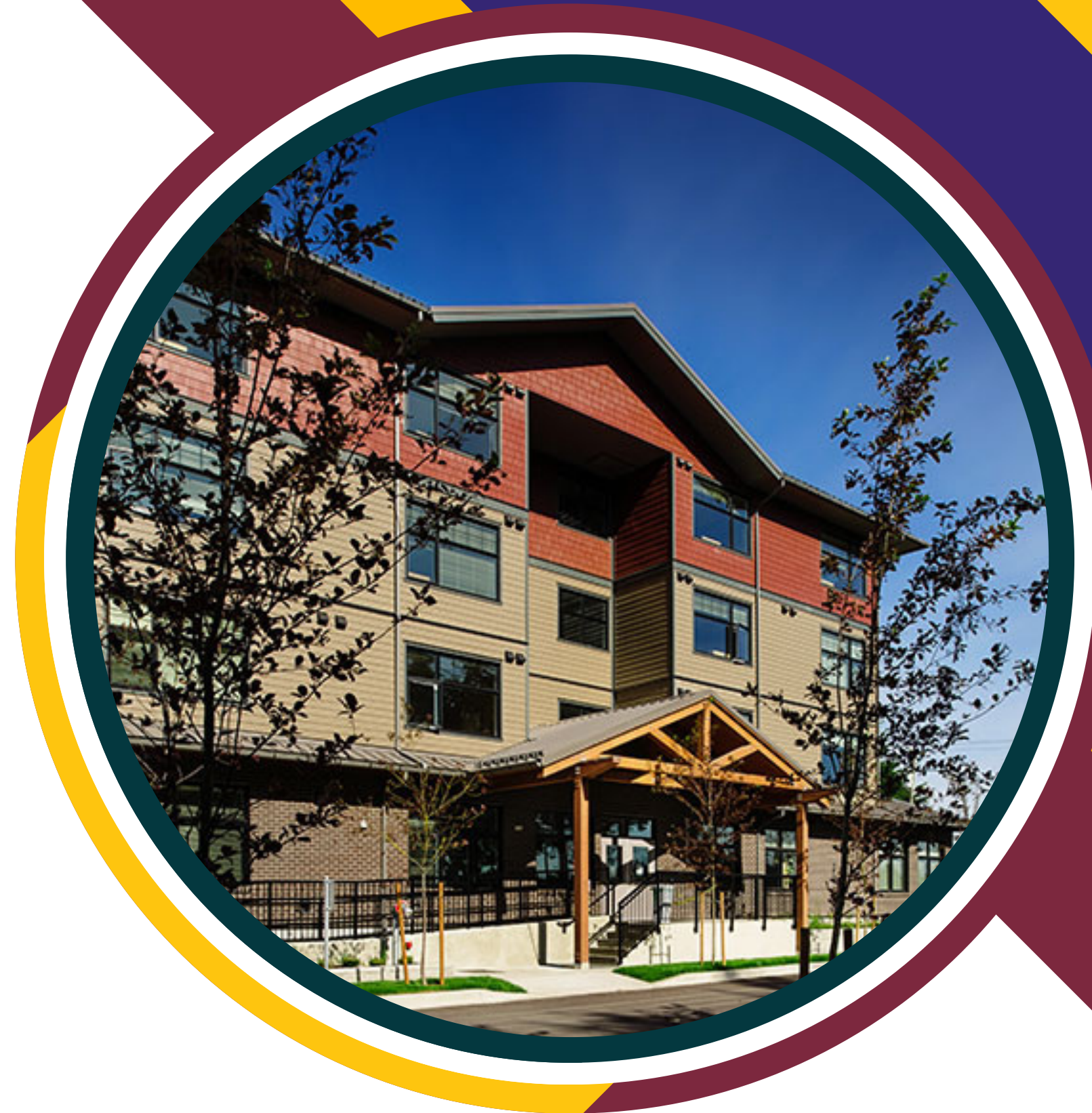
GEORGE SCHMIDT CENTRE