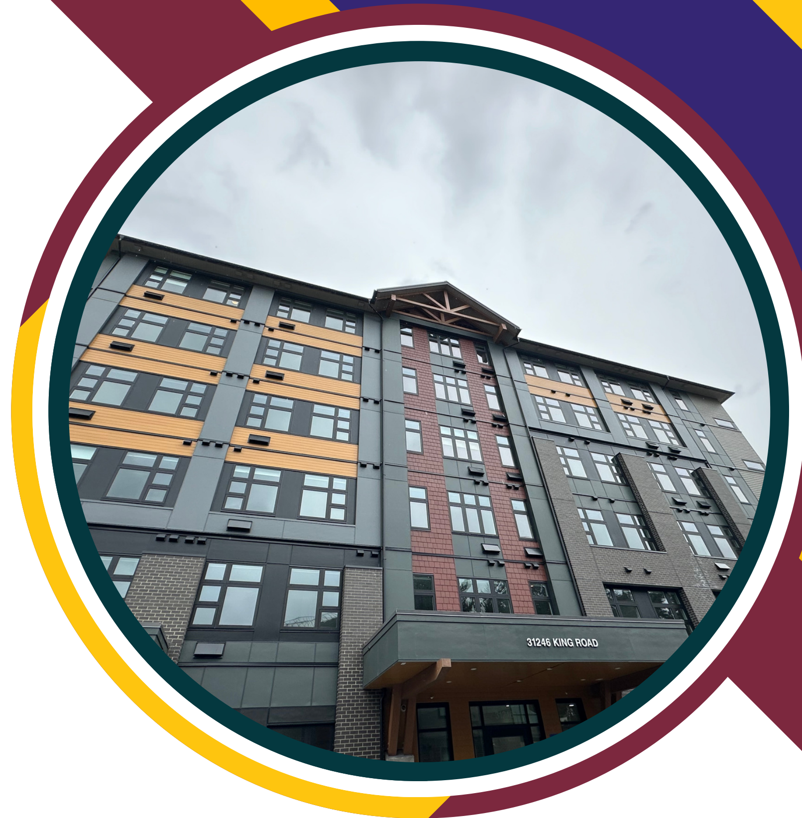
BOB SUTTON CENTRE