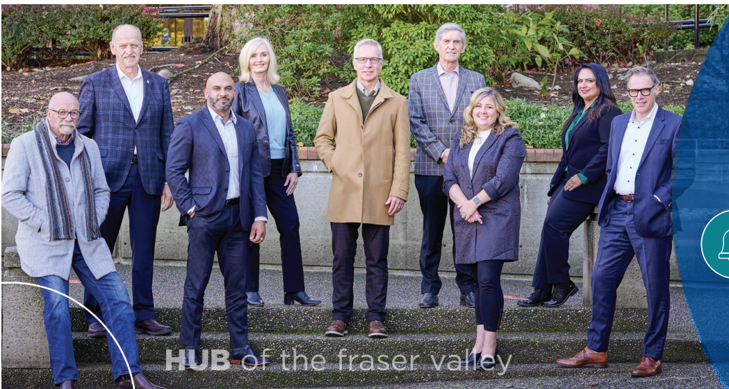
HUB of the Fraser Valley

Council meetings will be streamed live and archived at abbotsford.ca/watchcouncilonline . To view agendas, visit abbotsford.ca/ams .