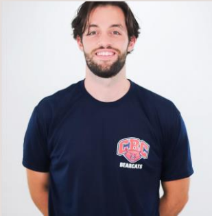
Aaron Adrian Cyrus Centre