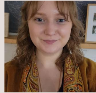
Taylor McDonald Cyrus Centre