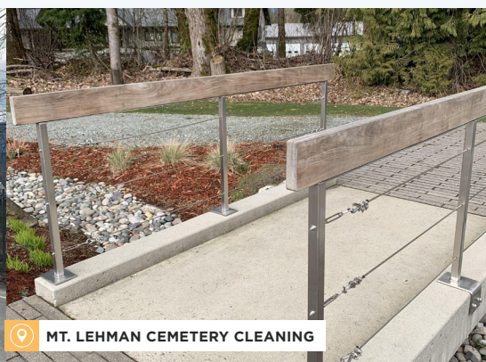
MT. LEHMAN CEMETERY CLEANING