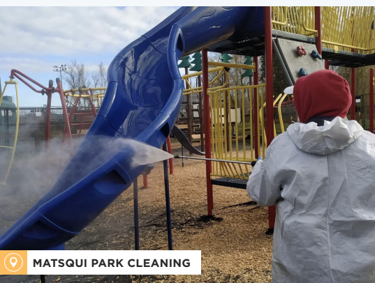
MATSQUI PARK CLEANING