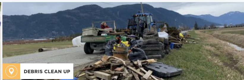
DEBRIS CLEAN UP

8.5 metric tonnes of debris removed from 30 farmer's fields during "Adopt A Farmer's Field" volunteer event.